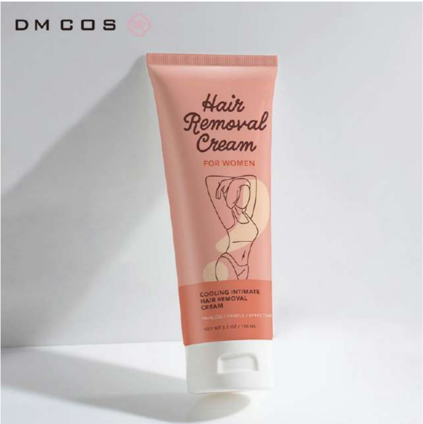
HAIR REMOVAL CREAM