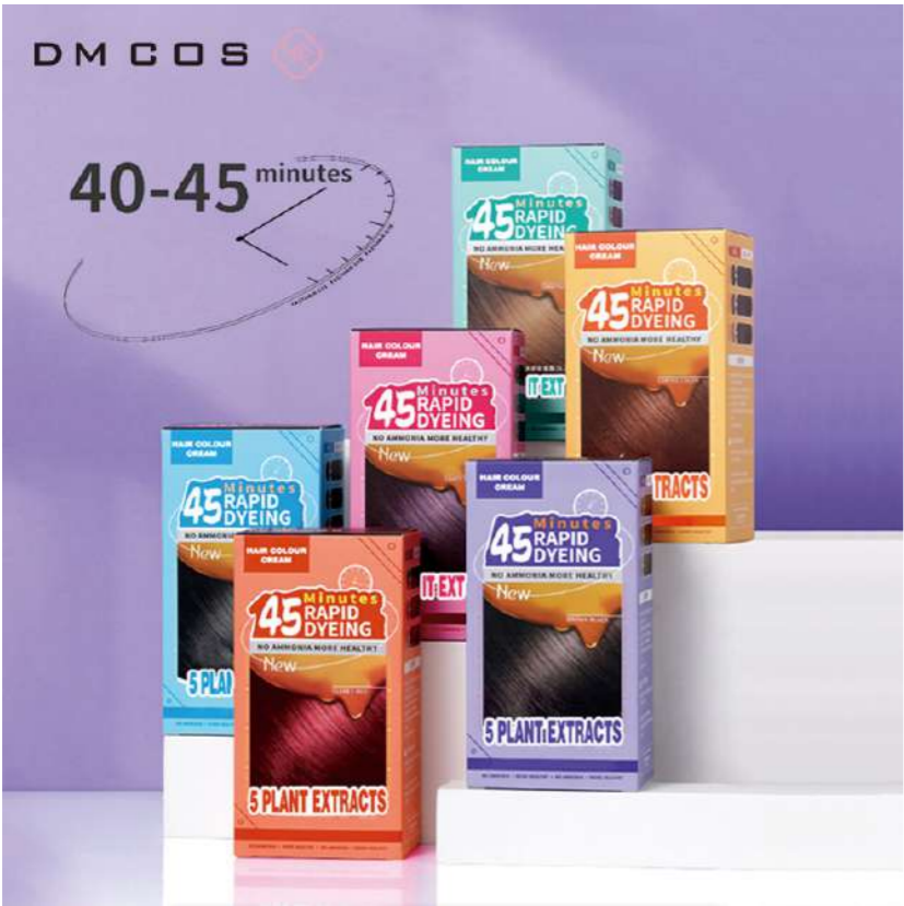
HAIR COLOR CREAM