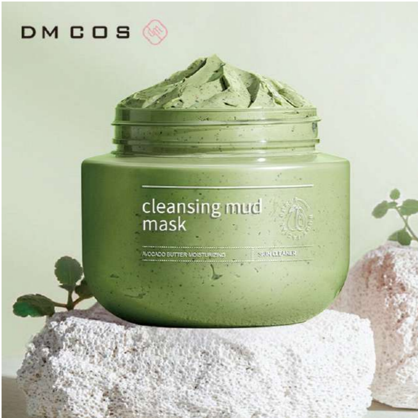
FACIAL CLEANSING MUD MASK