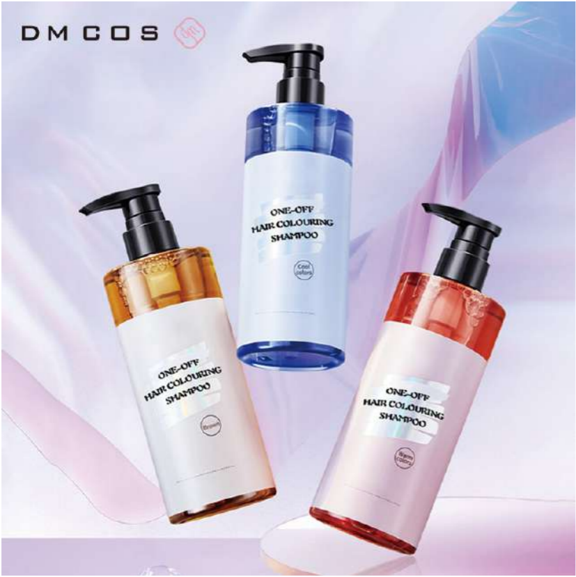
SEMI-PERMANENT HAIR COLOR SHAMPOO