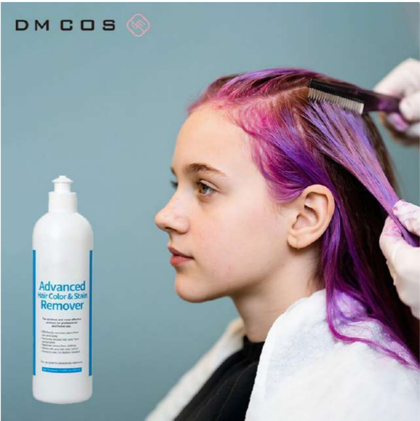
COLOR REMOVAL CREAM