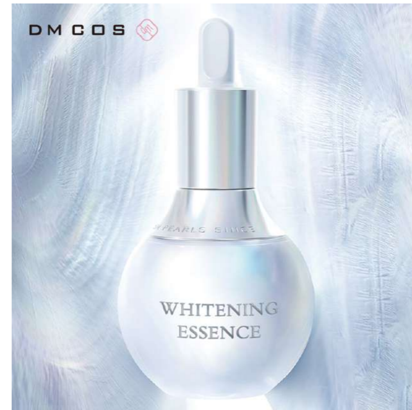
WHITENING FACIAL CREAM