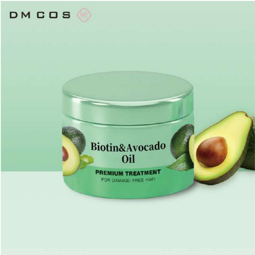
HAIR HOT OIL TREATMENT