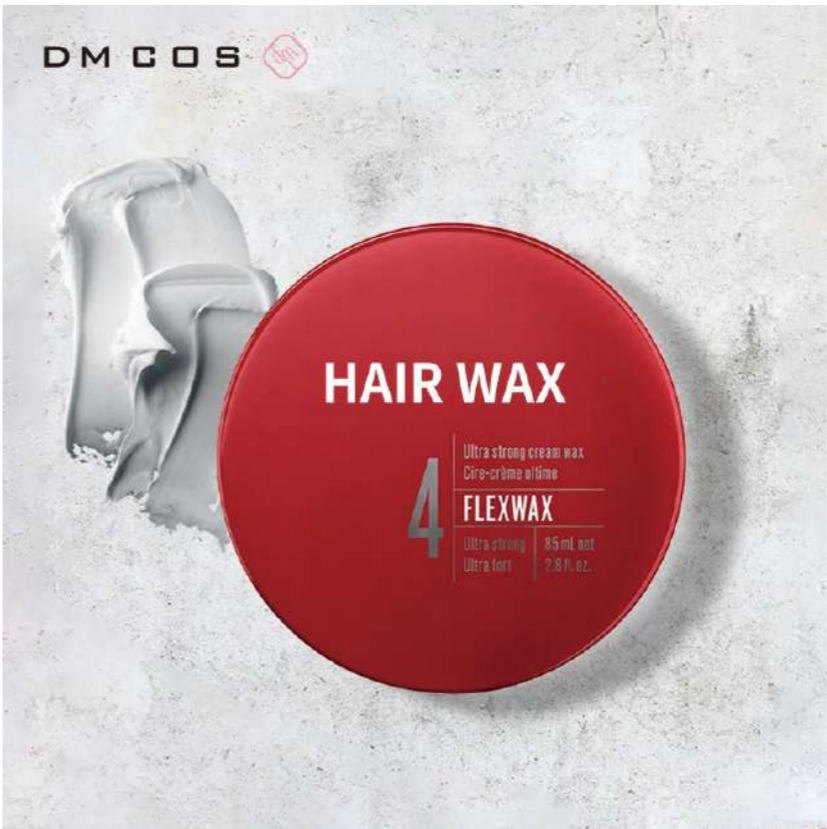
HAIR STYLING WAX