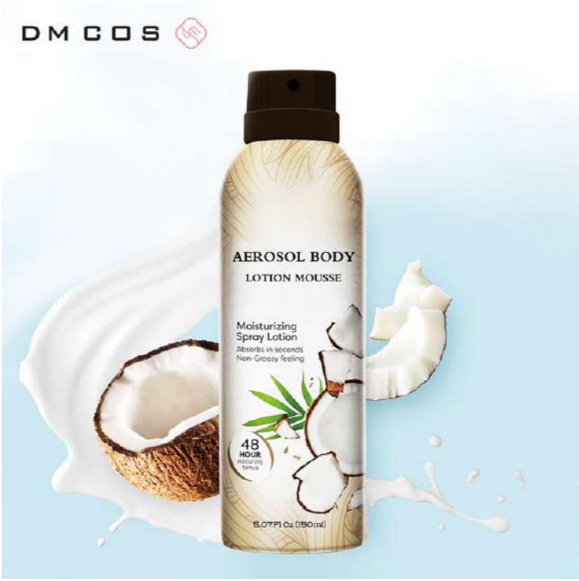
UNITARY AEROSOL BODY LOTION MOUSSE