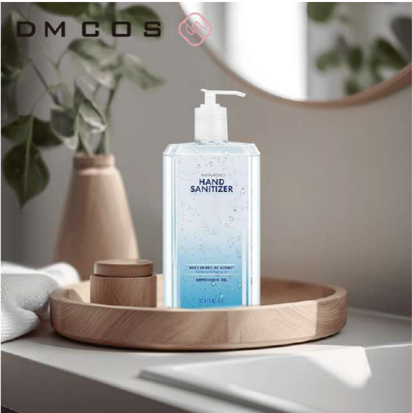
ANTI-BACTERIAL HAND SANITIZER