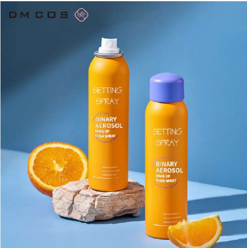
MAKE UP FIXING SPRAY