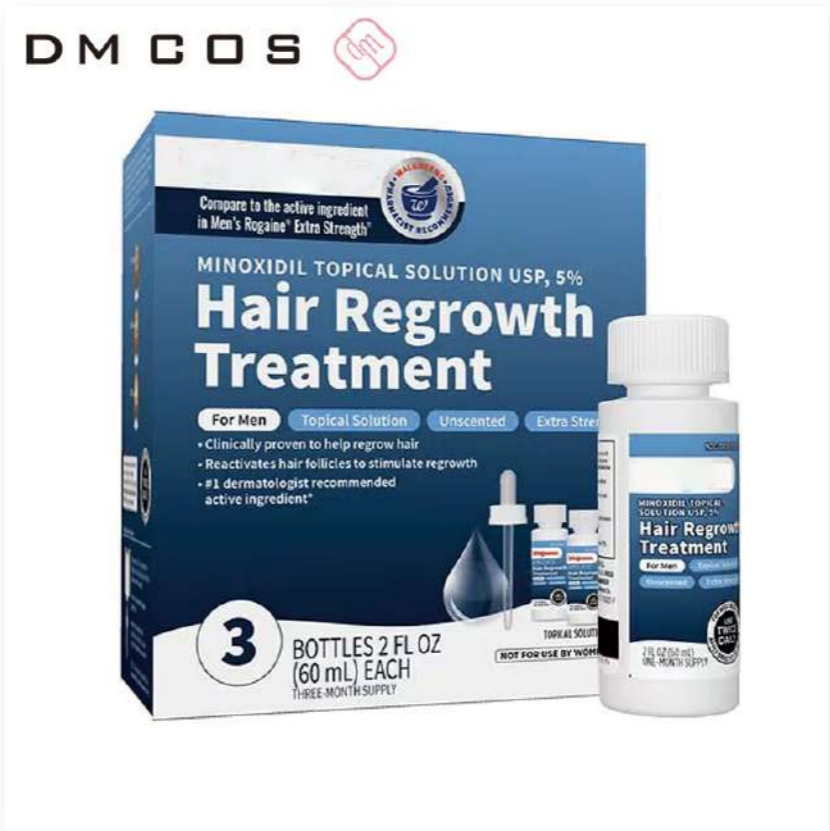
ANTI-HAIR LOSS ESSENCE(MALE)