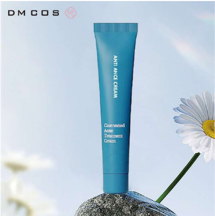
ANTI ANCE CREAM