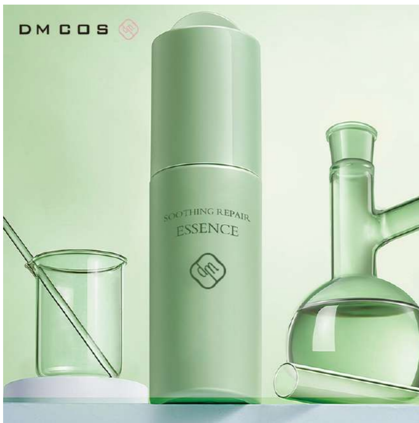
SOOTHING REPAIR SERUM