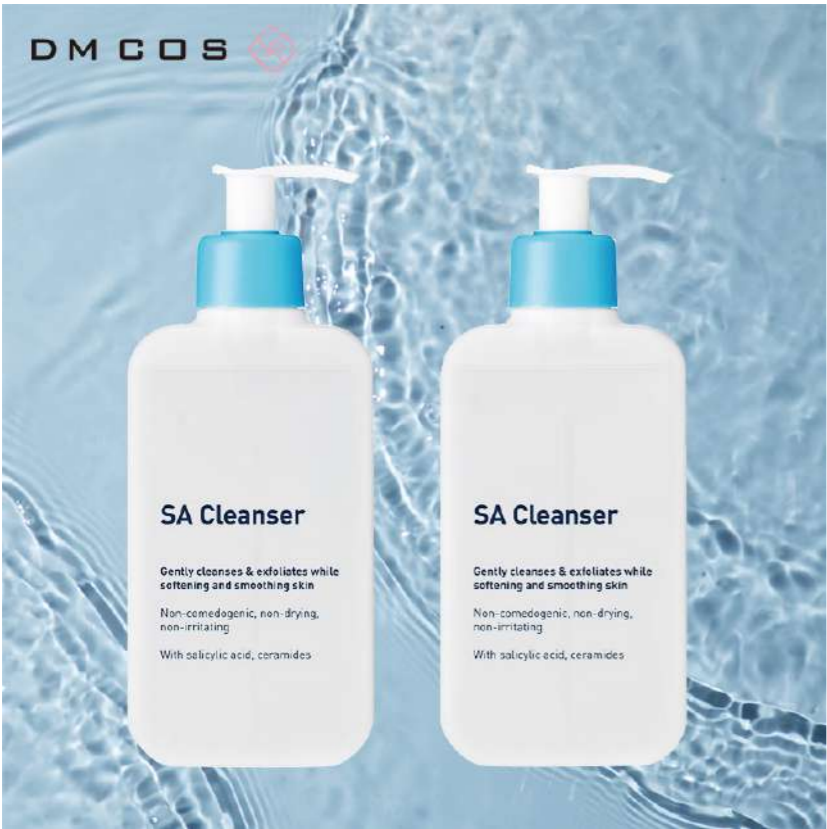
ANTI ACNE FACIAL CLEANSER