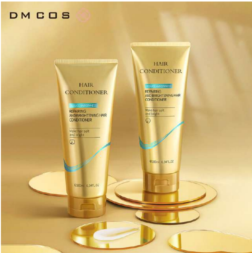
HAIR CONDITIONER MASK