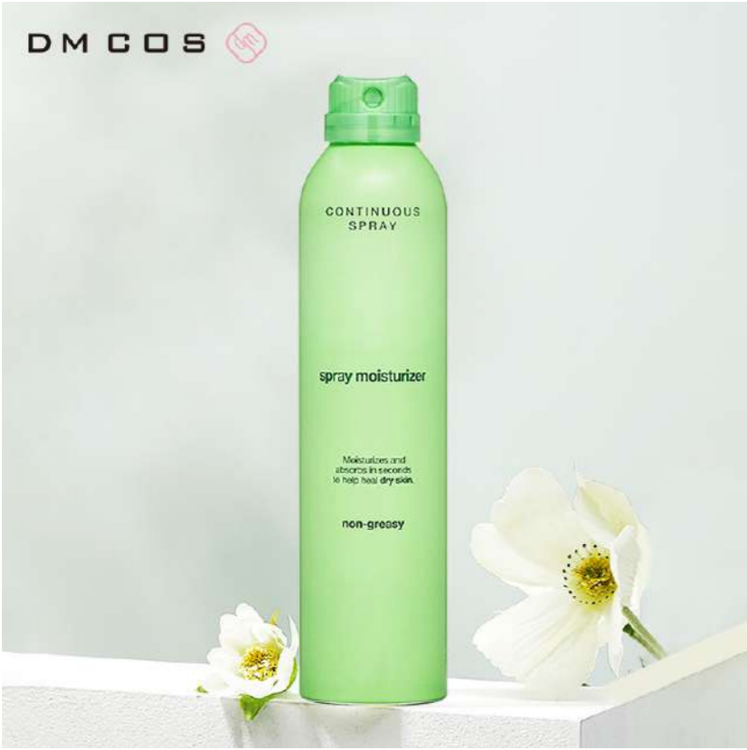
BINARY AEROSOL BODY LOTION SPRAY