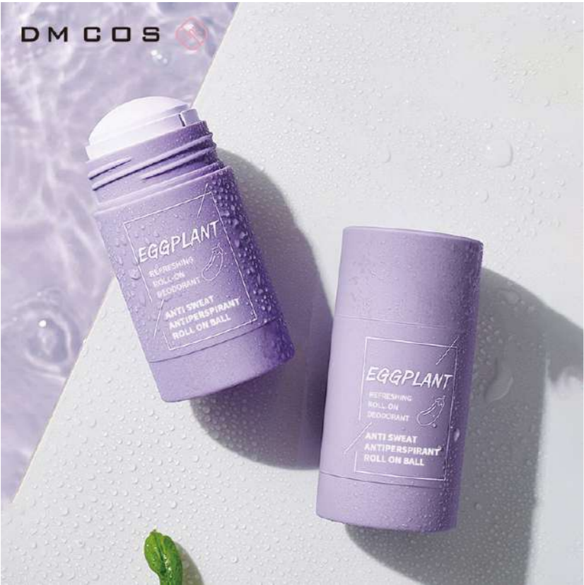
ANTIPERSPIRANT ROLL ON BALL