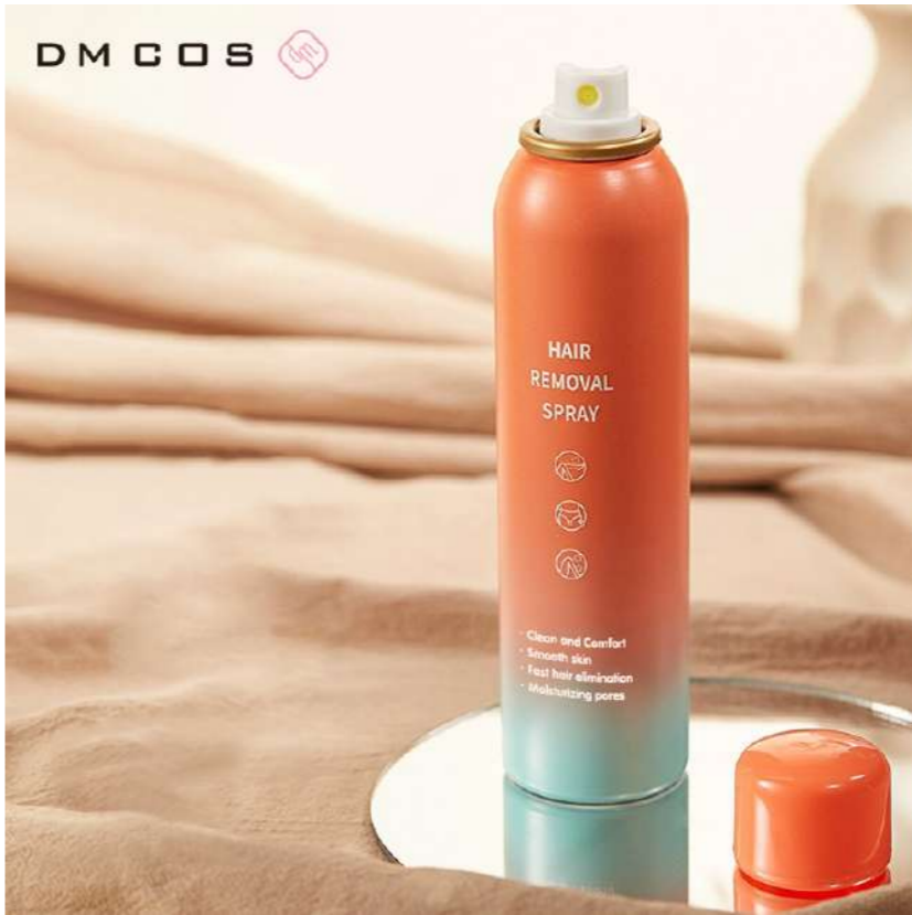
HAIR REMOVAL SPRAY