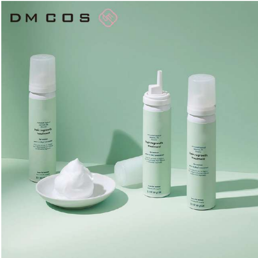
ANTI-HAIR LOSS FOAMS