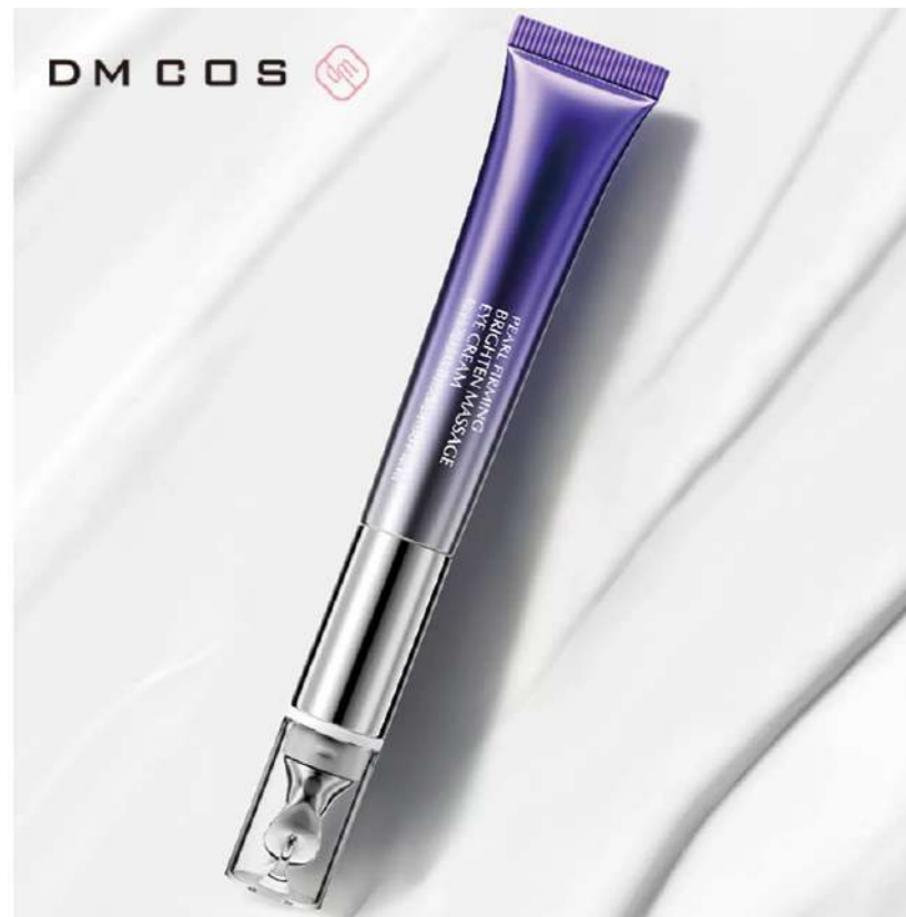
REMOVING EYE CREAM