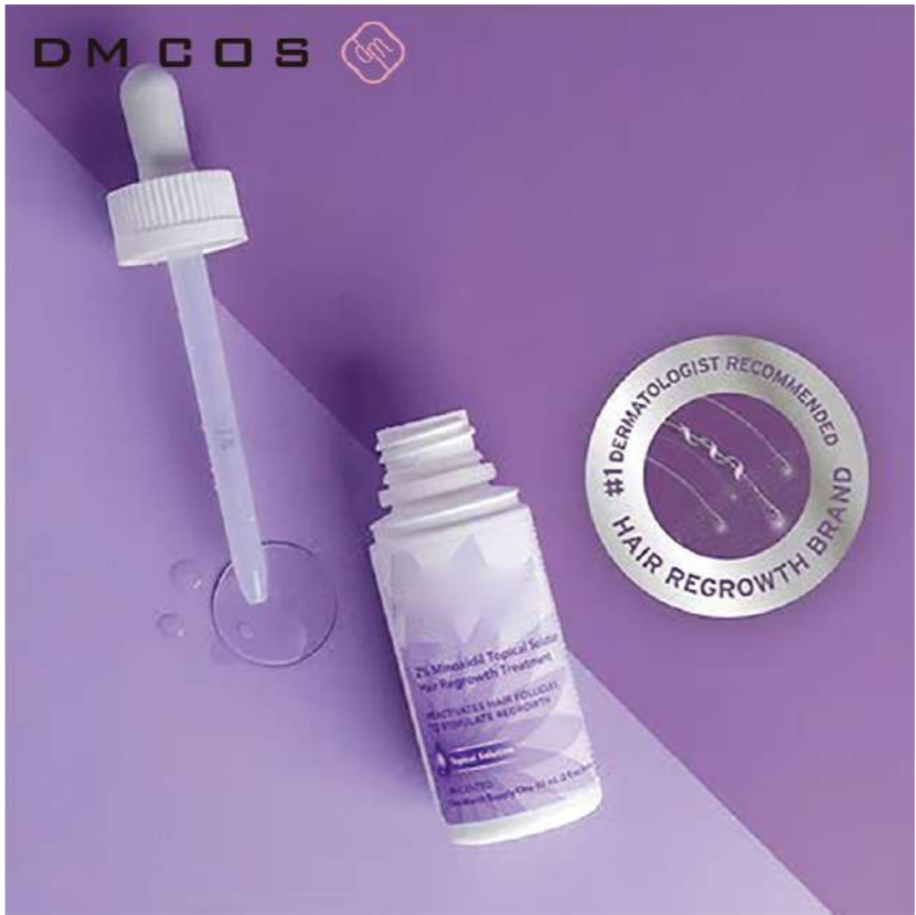
ANTI-HAIR LOSS ESSENCE(FEMALE)